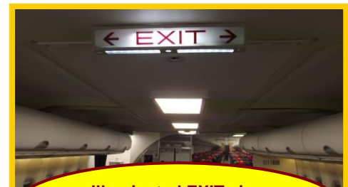
Illuminated EXIT sign controlled by the FAP

We can build you a range of Mock-up cabin options which are shown on the following pages – just ask us for your specific requirements. Full Mock-up Cabins can be shipped & fully installed to most places worldwide. Smaller Half & Midi options are listed below.