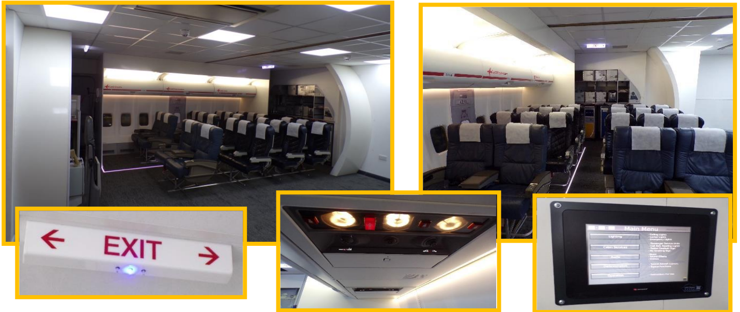
Example of a Cut-away four row mock-up cabin within a classroom – this included a rear full width galley, FAP/HMI system, full electronics, PSUs and Exit/ACP indication + lighting