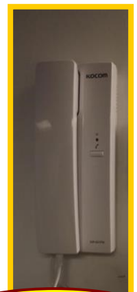
Interphone & PA Handset system