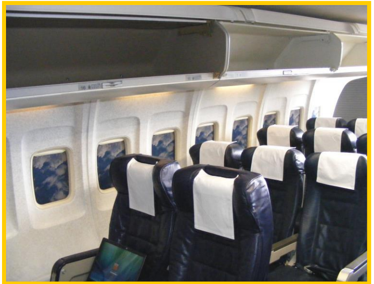
Example of a larger mock-up across a classroom – we can provide these fully built, delivered and installed to worldwide destinations