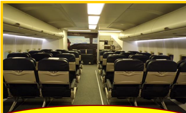
Interior of Full Mock-up Cabin – from rear