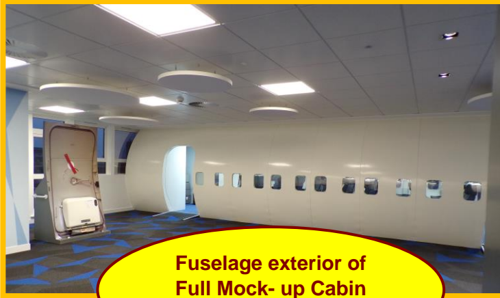
Fuselage exterior of Full Mock-up Cabin inc. SIM Door Trainer

We offer a range of both full mock-ups like the stunning example below (just a few featured shown) as well a range of half mock-up cabins & check-in areas as alternatives to match with an institution's specific budget, space and other considerations.