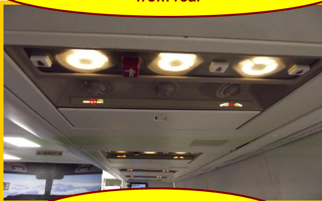
Fully operational Passenger Service Units – controlled by the FAP