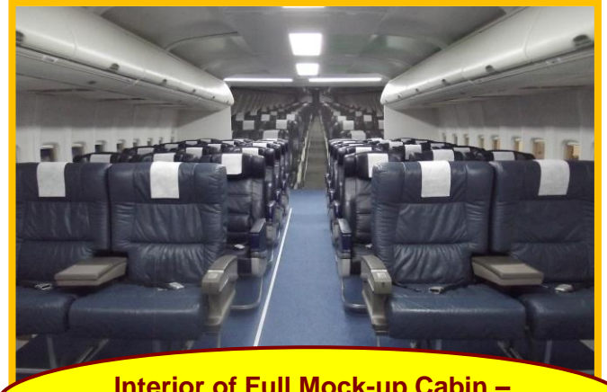
Interior of Full Mock-up Cabin – from front of cabin