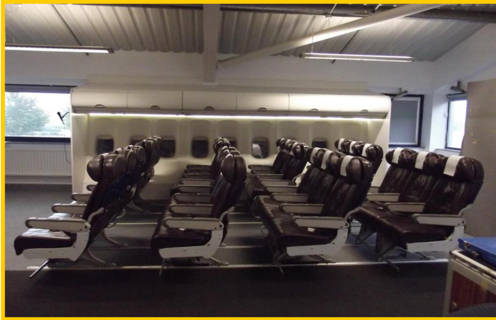
Example of a four row Midi-mock-up cabin and central aisle within a classroom