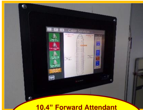
10.4" Forward Attendant Panel/HMI – controls the cabin electronics system