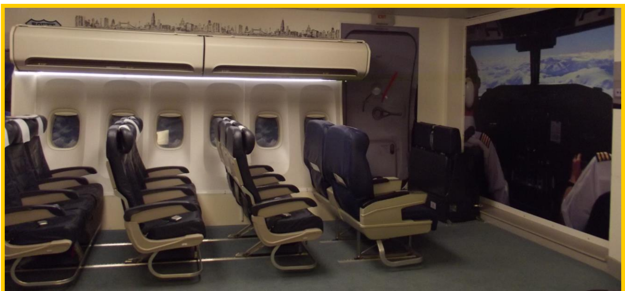
A mock-up cabin with two class seating – with flight deck and door images