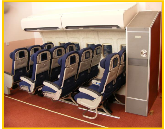
Example of a four row mock-up cabin and Check-in + Galley within a classroom