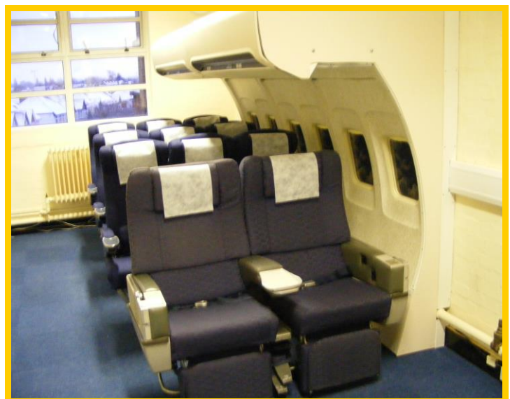
Another mock-up cabin option in a smaller classroom with 2 class seating