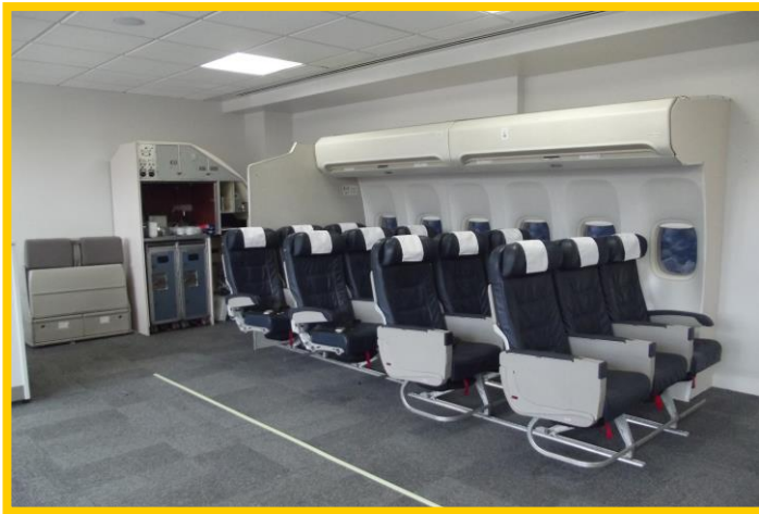
Example of a leather four row mock-up cabin