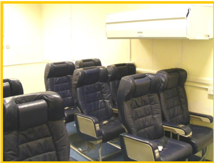
Double Business Leather Seat Mock-up