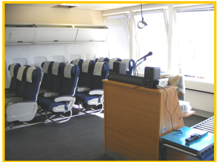
Larger Mock-up + Check-in