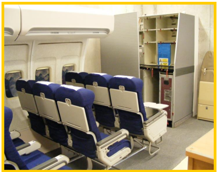
Example of a four row mock-up cabin within a classroom